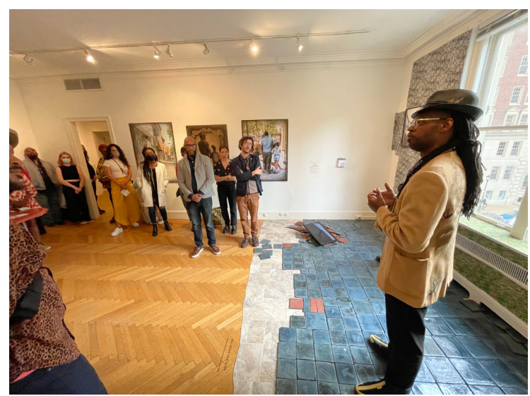
Pictured: Top – NewCourtland Fellowship; Bottom – Visiting Curator Exhibition 2022